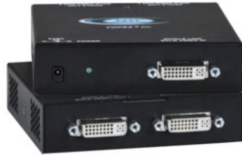
VOPEX-DVI4K-2 (Front and Back)

The VOPEX® DVI/HDMI 4K Video Splitter simultaneously displays the same Ultra-HD 4Kx2K image from one single link DVI/HDMI video source to two displays.