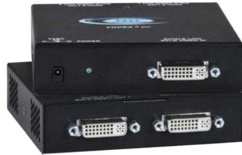
VOPEX-DVI4K-2 (Front and Back)

The VOPEX® DVI/HDMI 4K Video Splitter simultaneously displays the same Ultra-HD 4Kx2K image from one single link DVI/HDMI video source to two displays.