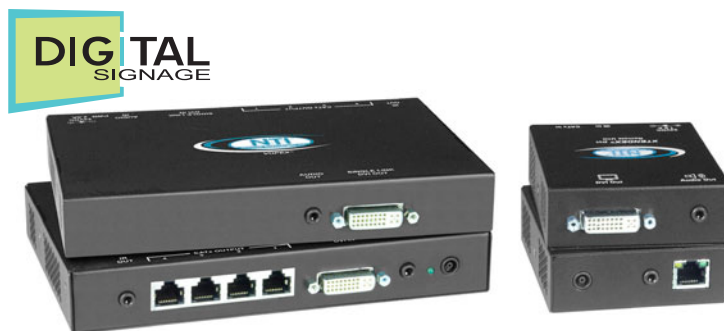
VOPEX-C6DVIA-LA-4 Local Unit (Front & Back) and ST-C6DVIA-IR-R-300 Remote Unit

The VOPEX® DVI Splitter/Extender simultaneously distributes high resolution single link digital DVI video from one video source to up to 4 displays, each located up to 300 feet (91 meters) away using a single CAT5e/6/7 cable.