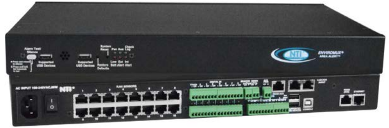
ENVIROMUX-16D (Front & Back)