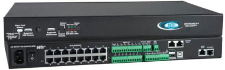
ENVIROMUX-16D (Front & Back)