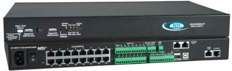
ENVIROMUX-16D (Front & Back)