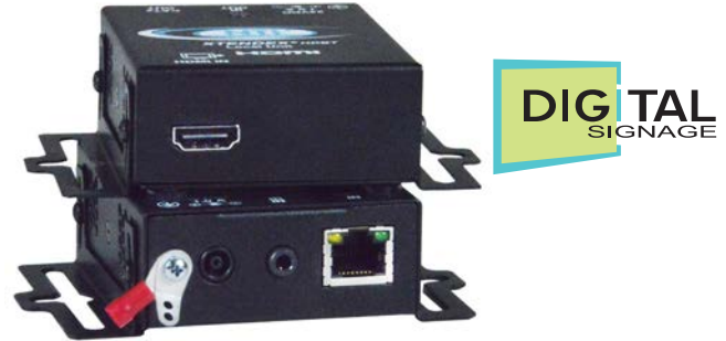
ST-C6HD-HDBT (Local and Remote Units)