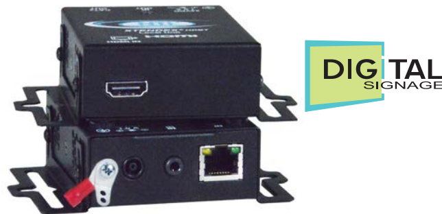
ST-C6HD-HDBT (Local and Remote Units)