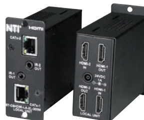
Dual HDMI Transmitter Module ST-C5HD-LA-2L-300M (Front & Back)