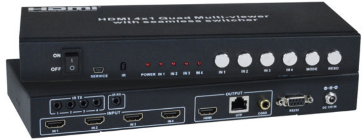
SPLITMUX-C5HDR-4LC (Front & Back)