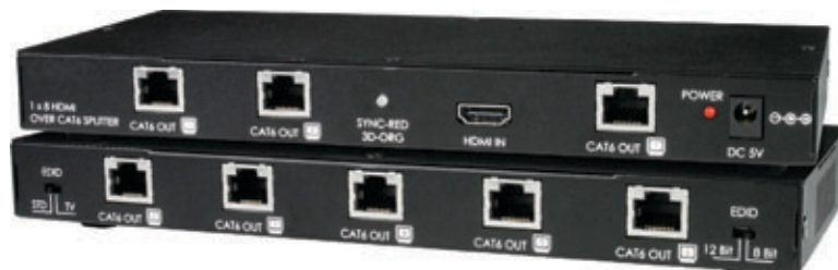
VOPEX-C6HD-8LC Local Unit (Front & Back)