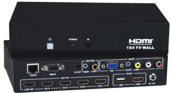
SPLITMUX-VWC-4HDLC (Front & Back)

The SPLITMUX® Multi-Format HD Video Wall Controller allows you to display the video from one HDMI, VGA or composite video source across four 1080p HDMI monitors. Two processors can be cascaded to create a video wall up to 3x3 - 9 screens. Additionally, it can be used as a video splitter, video converter and video switch.