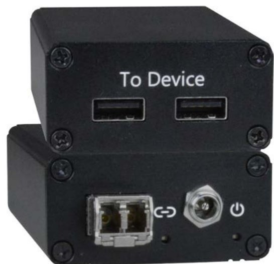
Remote Unit (Receiver)