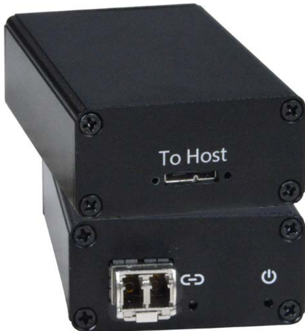
Local Unit (Transmitter)