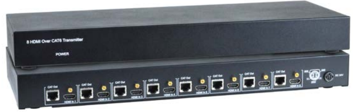
XTINDEX® ST-C64K-328-L8-R (Front & Back)