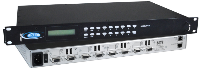
UNIMUX-4X8-UHD (Front and Back)

The UNIMUX™ High Density VGA USB KVM Matrix Switch allows up to four users to individually command or simultaneously share up to 32 USB computers. Access USB computers (PC, SUN, and MAC) using USB keyboards and mice, and VGA multiscan monitors.