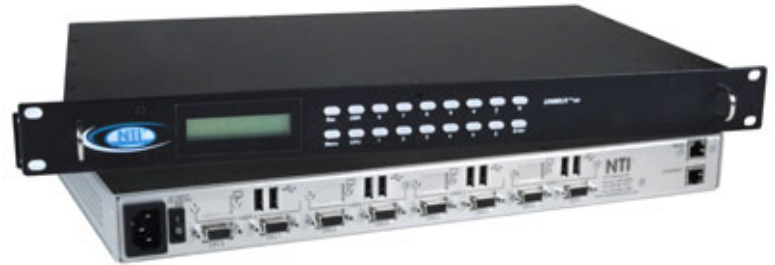
UNIMUX-4X8-UHD (Front and Back)

The UNIMUX™ High Density VGA USB KVM Matrix Switch allows up to four users to individually command or simultaneously share up to 32 USB computers. Access USB computers (PC, SUN, and MAC) using USB keyboards and mice, and VGA multiscan monitors.