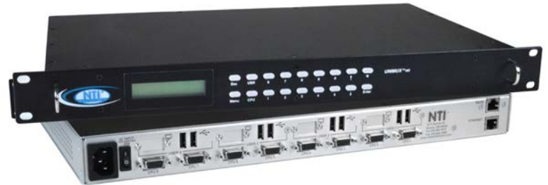
UNIMUX-4X8-UHD (Front and Back)

The UNIMUX™ High Density VGA USB KVM Matrix Switch allows up to four users to individually command or simultaneously share up to 32 USB computers. Access USB computers (PC, SUN, and MAC) using USB keyboards and mice, and VGA multiscan monitors.