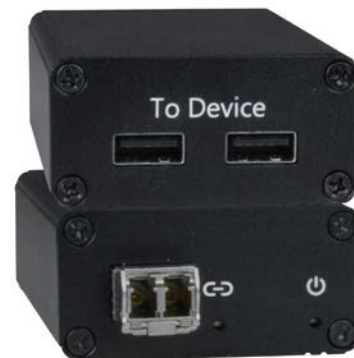
USB3ONLY-2FOLCx (Remote and Local Units)