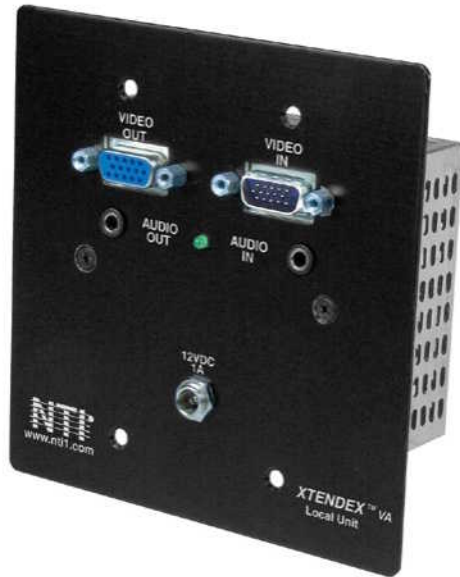
XTENDEX™ ST-C5VA-WL500 (Local Unit)

Extend a VGA monitor and stereo audio speakers up to 500 feet away from a computer